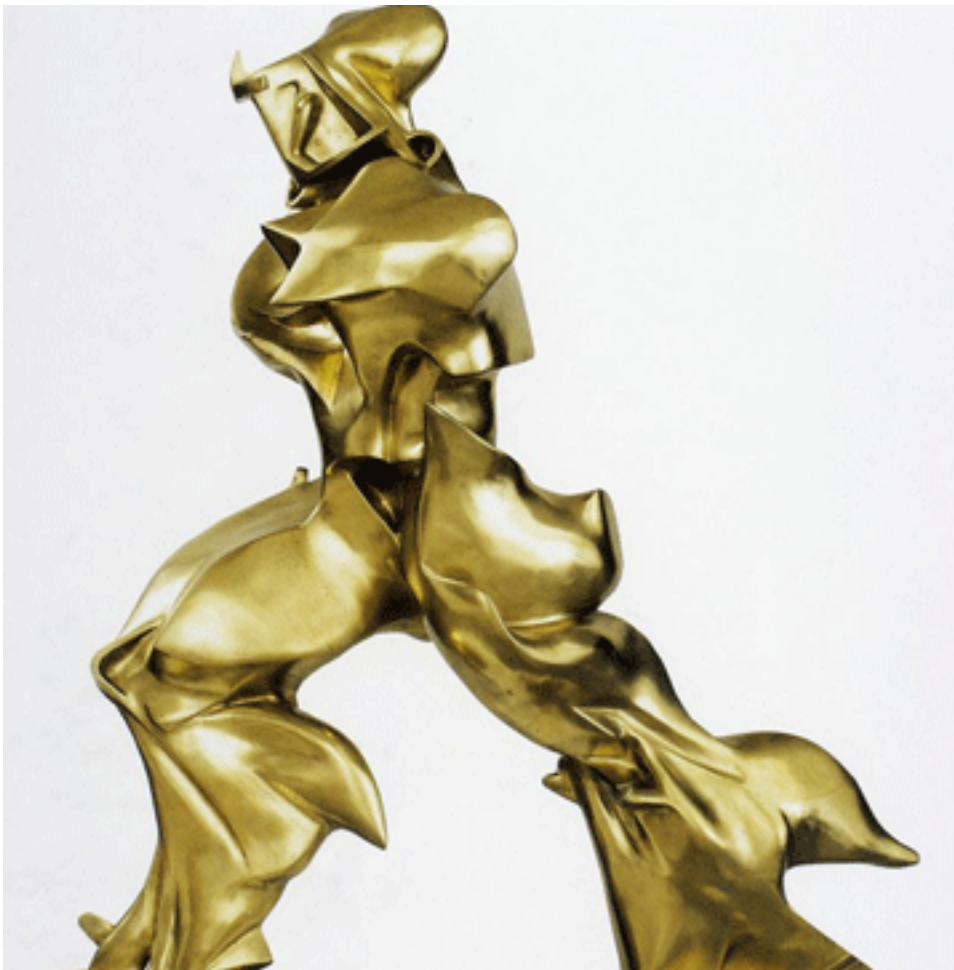
Umberto Boccioni, Unique Forms of Continuity in Space , 1913